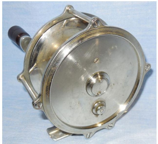
Tailplate of the Kopf “New Style” reel.